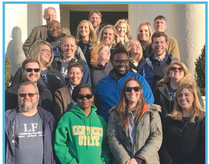
FRANKFORT365 leadership team